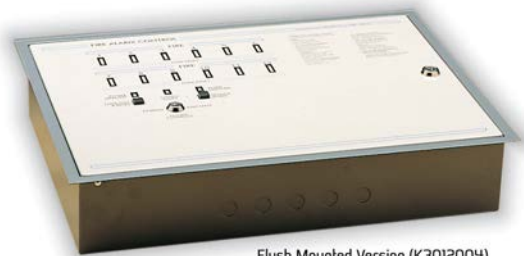
Flush Mounted Version (K3012004)